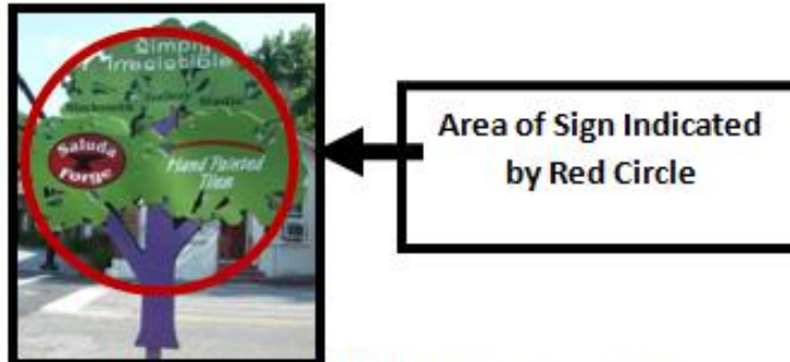
Example Illustrating Measurement of the Area of an Irregularly Shaped Sign

SIGN COPY. Any graphic design, letter, numeral, symbol, figure, device or other media used separately or in combination that is intended to advertise, identify or notify, including the panel or background on which such media is placed.